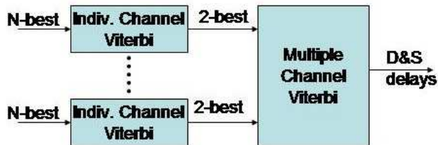
Fig. 3. Delay and Sum double-viterbi delays selection

clusters are set to be merged their delay models are combined in the same way as the acoustic models.